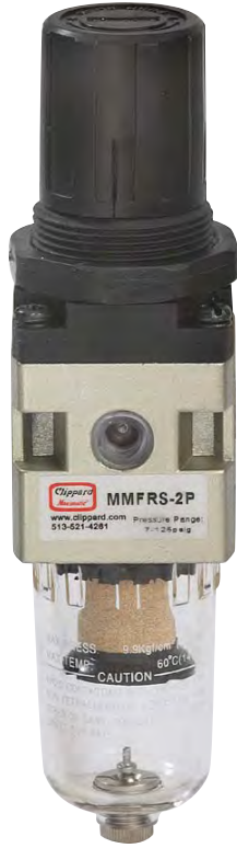
MMFRS-2P Stacking Filter-Regulator with Polycarbonate Bowl & Manual Drain