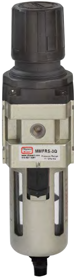
MMFRS-3Q Stacking Filter-Regulator with Bowl Shield & Semi-Automatic Drain