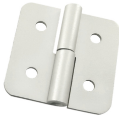
Left Hinge: 2836, 40-2836